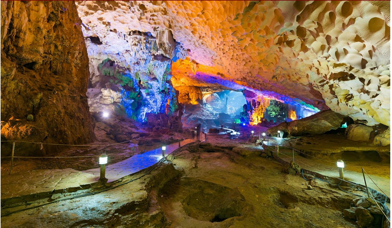
Thien Cung Cave in Halong bay

Leave for Halong Bay was awarded by UNESCO as a natural heritage in 1994. This four hour drive will show you the diversity of the North Vietnam villages and rice fields along the journey. Upon arrival, we start enjoying 4 hour boat trip. We walk into the Thien Cung cave (Heaven Palace cave) to see thousands of stalactites and stalagmites colored by hundreds of neon lights. After 1 hour stay in the “ Heaven Palace ”, we are back to the boat for cruising along the World Nature Heritage part to see the Incense Bowl islet, Cock fighting islets Sail islet, Turtle Island.... A delicious seafood lunch will be served when we are completely relax on boat. We are both having seafood and seeing the wonderful sightseeing outside.