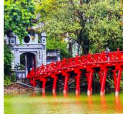
Hoan Kiem lake

After breakfast, tour guide and driver will pick you up and transfer to visit the Ho Chi Minh Complex , which includes Ho Chi Minh's Mausoleum - the final resting place of the beloved national hero, Uncle Ho - and President Ho Chi Minh's stilt house where he lived off and on from 1958 to 1969. Enjoy the architectural and historical aspects of Uncle Ho's final resting-palace lying to one side of the Mausoleum is the One Pillar Pagoda , built by King Ly Thai To in 1049 the structure has become an important symbol for the people of Hanoi. After that, we will continue to visit the Literature Temple and Quoc Tu Giam - Vietnam's first University, constructed in 1070. Its gardens and well-preserved architecture offer a relaxing glimpse into Vietnam's past. Then we will stop at Hoan Kiem Lake (Sword Lake) and learn more about the lake's legend, visiting outside of Ngoc Son Temple and free shopping at Hanoi Old Quarter .