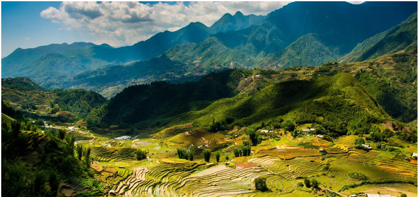
Rice Terraces fields in Sapa

October to December: With cool nights and warm days, the weather is ideal for outdoor activities such as trekking, visiting ethnic villages, and immersing yourself in the refreshing natural surroundings. When the whole region gets really chilly, often dipping below 0°C, and the cold air is in full swing, you might see snowfall.