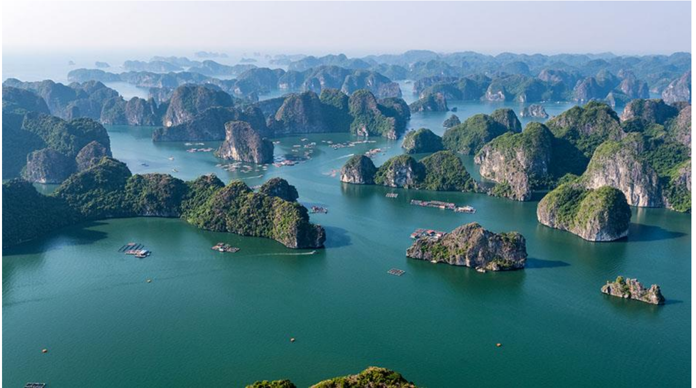
The overview of Halong Bay