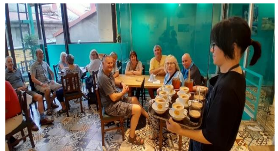
Egg coffee in Hanoi

Back to Hanoi and transfer to Centre for enjoy Egg coffee - is a Vietnamese nationally acclaimed specialty made of egg yolks, sugar, condensed milk, and robusta coffee and watch Egg Coffee show performed by the staff.