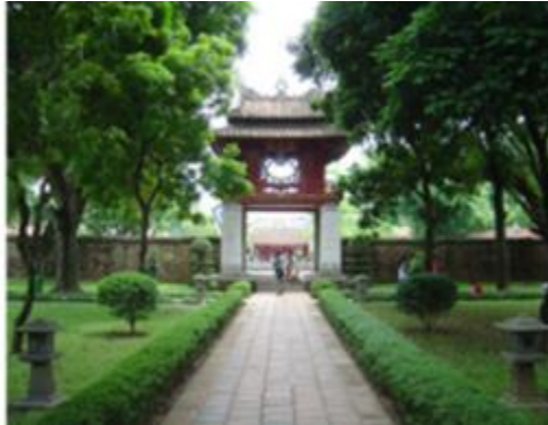
Temple of literature