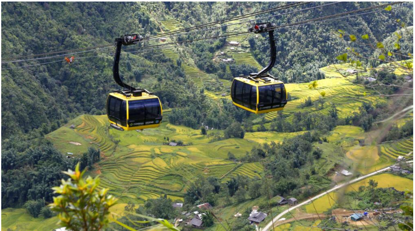
Fanxipan Cable Car in Sapa

As the highest mountain in Vietnam and in Indochina, Fansipan Mountain offers breathtaking views of the surrounding valleys, verdant forests, and traditional hill villages. Whether you are an avid trekker or just want to reach the mountain top, Fansipan promises an unforgettable experience that will leave you in complete awe.