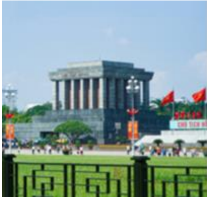
Ho Chi Minh Mausoleum