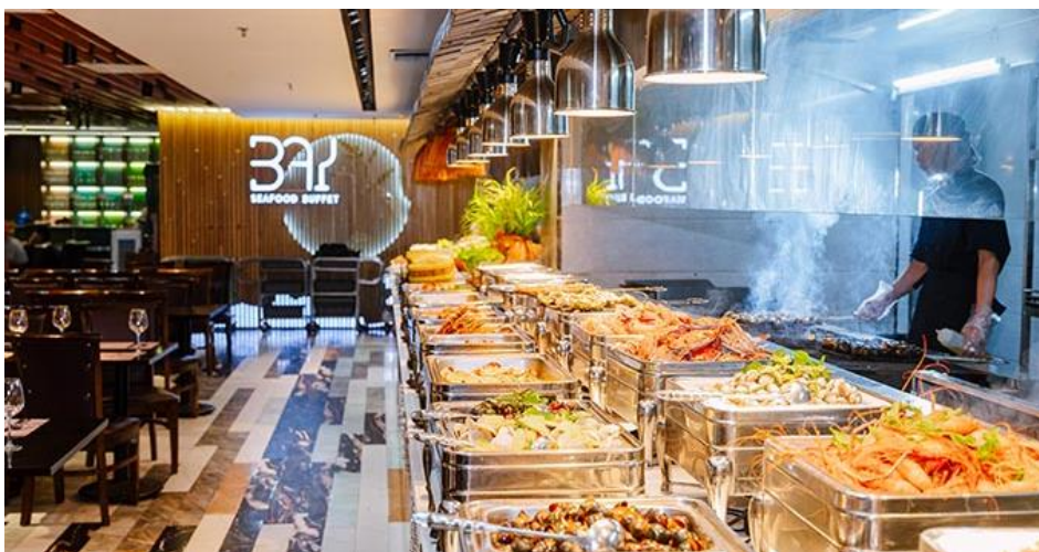
Bay Seafood Buffet